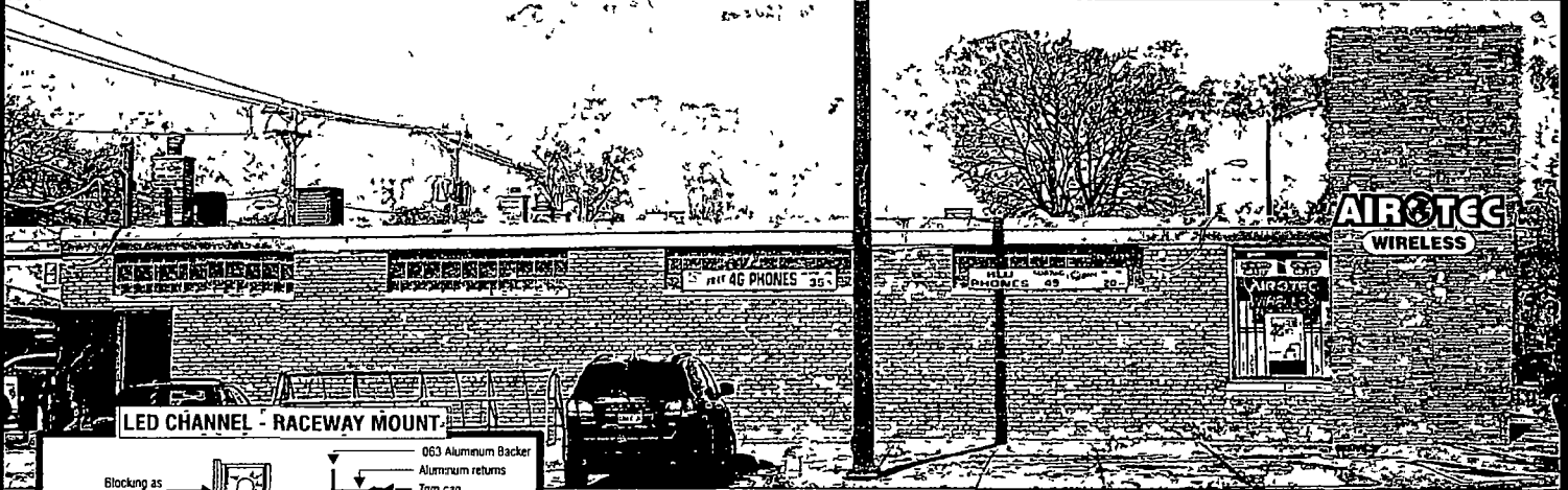
LED CHANNEL - RACEWAY MOUNT