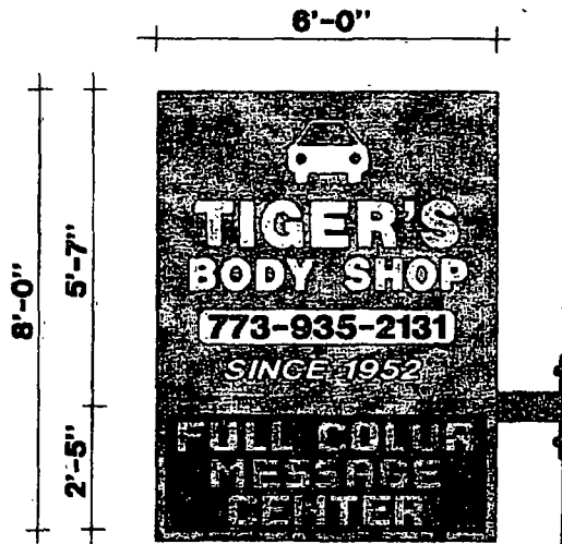
6'x8' DOUBLE FACE SIGN