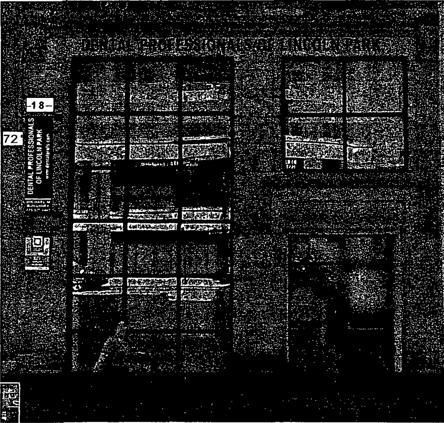
BACK LIT CHANNEL LETTER SIGN LED ILLUMINATED W/RACEWAY

INDEPENDENT NEON & SIGNS 1810 W IRVING PARK CHICAGO, IL 60640 773-248-1969