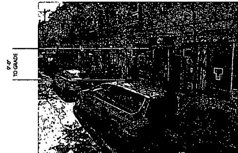
Rendering - N.T.S.