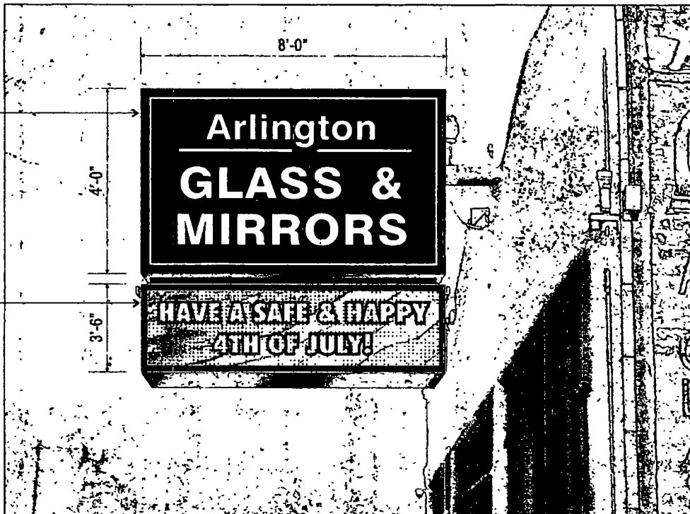
(1) D/F ILLUMINATED SIGN