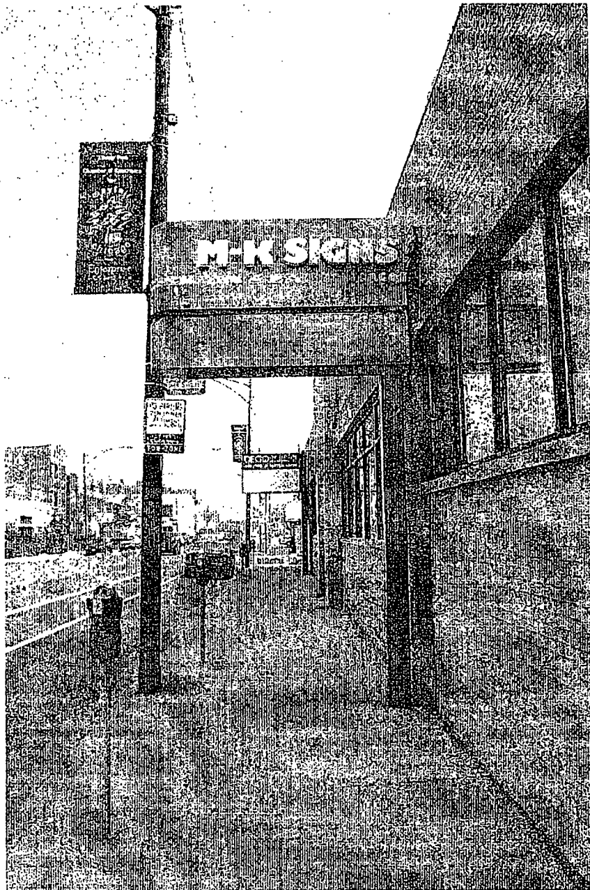
EXISTING SIGN MEASURES 4'-0" HT. x 7'-0" W x 1'-0" DEEP 10'-0" BOTTOM OF SIGN TO SIDEWALK