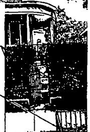
EXIST HISTORIC IRON FENCE AND GATE ABOVE GRANITE CURBS WITH STONE INFILL BETWEEN SIDEWALK AND CURB EXIST HISTORIC PARKWAY FENCE TO REMAIN (18' H)