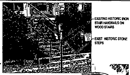
EXISTING HISTORIC IRON STAIR HANDRAILS ON WOOD STAIRS EXIST HISTORIC STONE STEPS