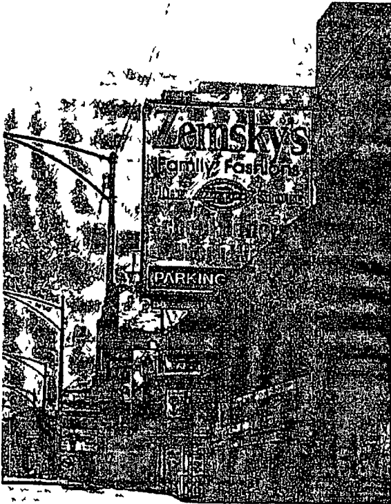
View looking [unclear]