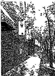
PHOTO RENDERINGS MAY NOT REFLECT SCALE ACCURATELY REFER TO SPECIFIED DIMENSIONS FOR CORRECT SIZES