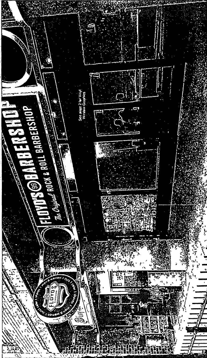
Storefront Elevation- 1/4" = 1' 0" Proposed at 46.49 ±'