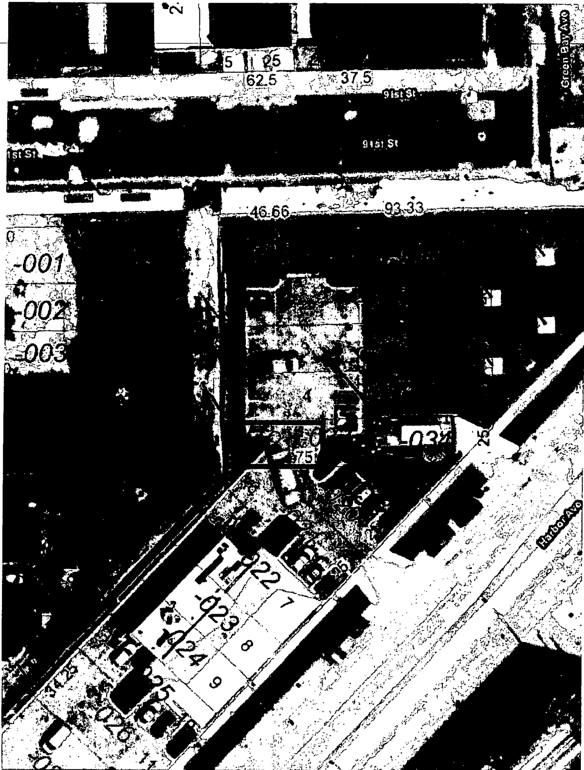
EXHIBIT A (the Premises)