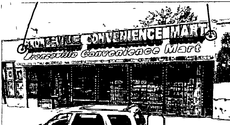
BEFORE AND AFTER PRE-EXISTING AWNING AND SIGN