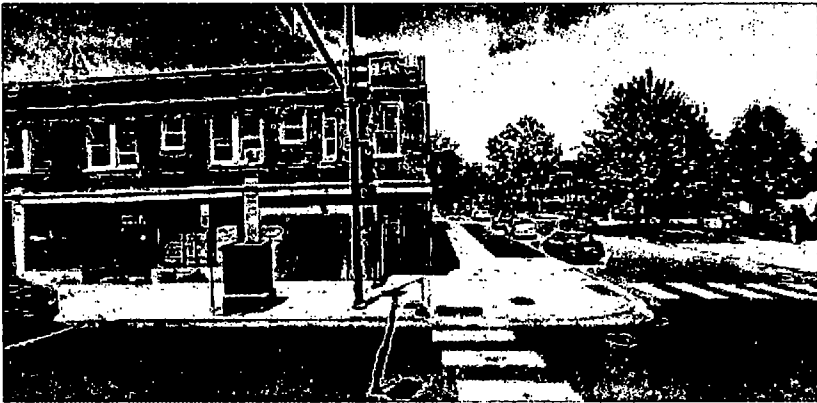
1758 E 79th St Chicago, IL 60649