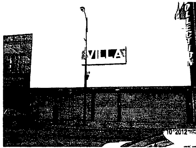
proposed signage Scale NTS