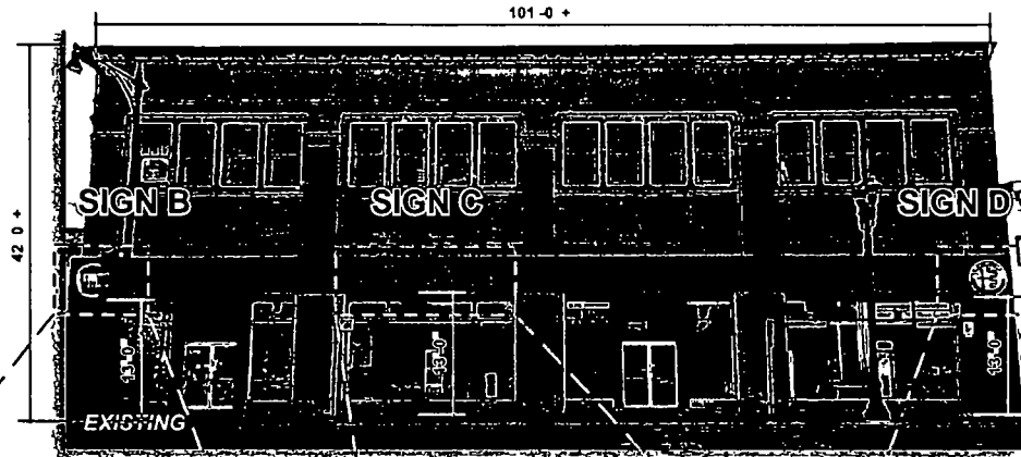
West Building Elevation -