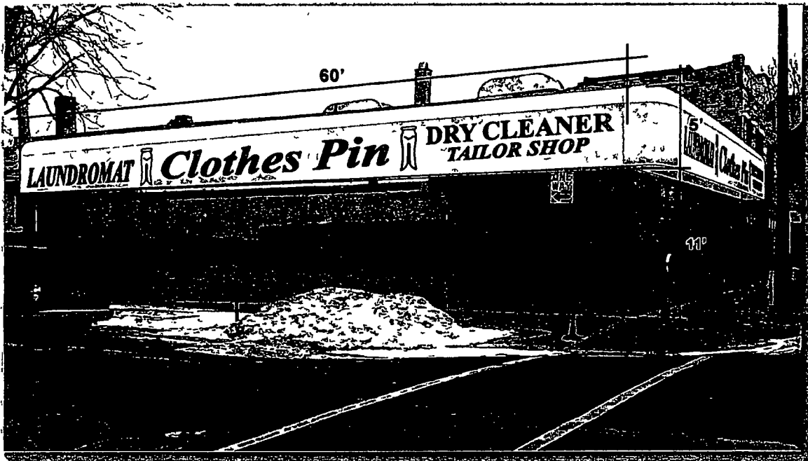
N Leland St View