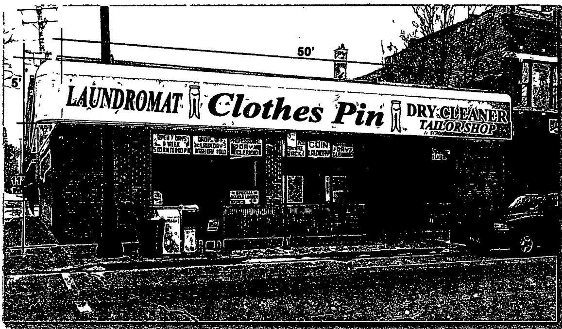
Kedzie Ave View