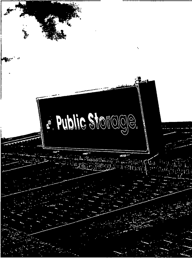
Sign - Van Buren St