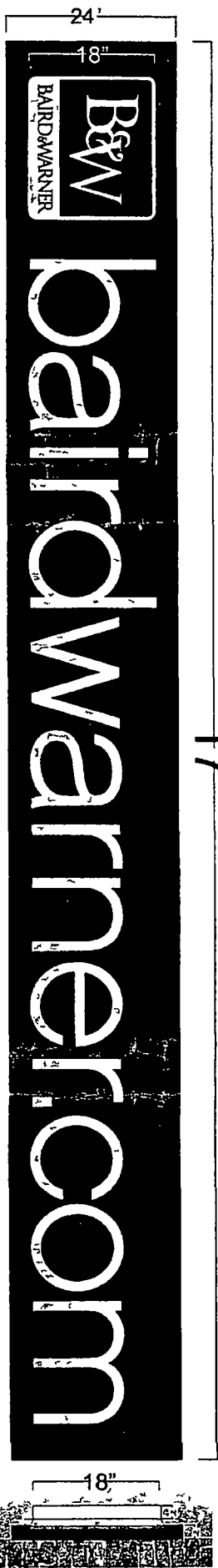
* Side view

THIS DRAWING IS THE PROPERTY OF IMPACT! SIGNS CHICAGO AND ALL RIGHTS TO ITS REPRODUCTION ARE RESERVED BY IMPACT! SIGNS CHICAGO