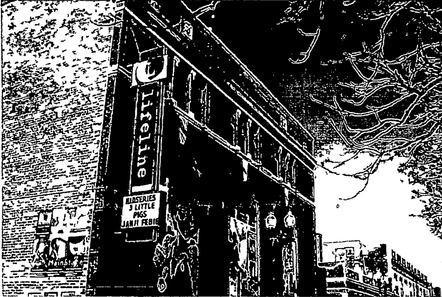
Front View of Subject Property