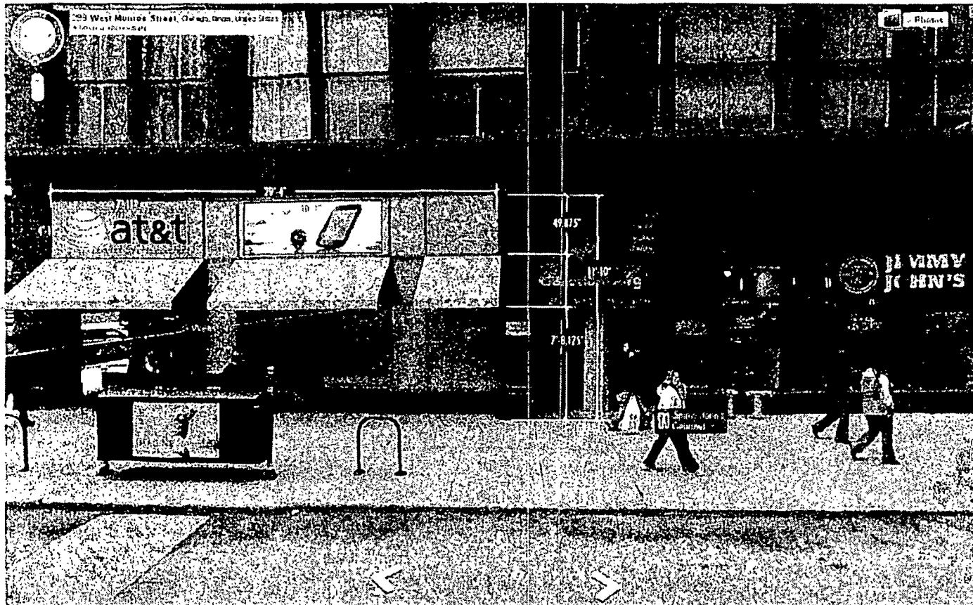
MONROE STREET BUILDING ELEVATION SCALE: N.T.S.