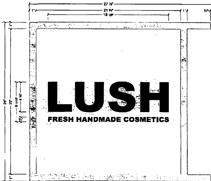
A NON-ILLUMINATED D/F BLADE SIGN SCALE: 3" = 1'-0"