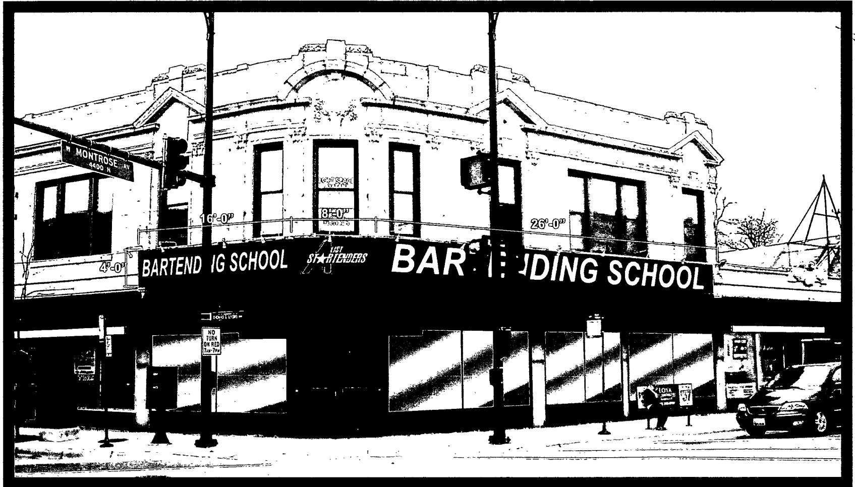
FASCIA BAND (4'-0" X 50'-0") - Sq.Ft. 200.0