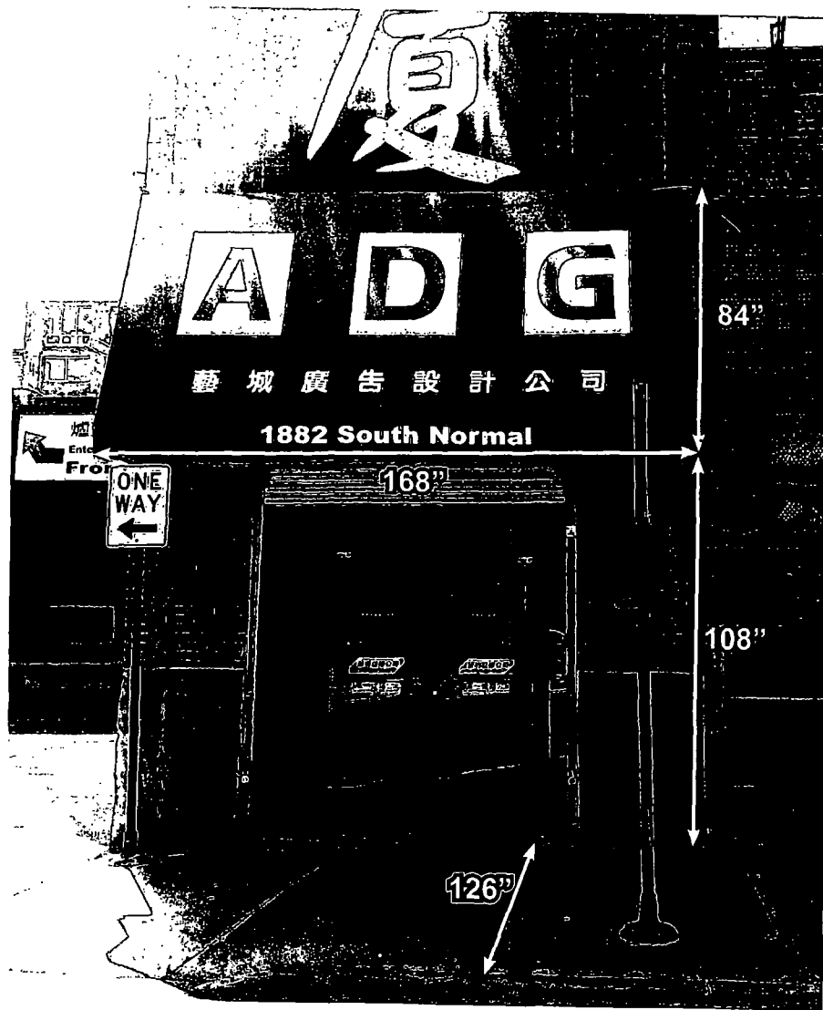
Awning photo & sketch