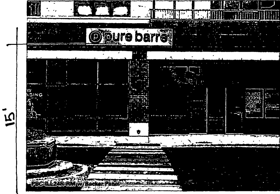
PBC-ILL24R-RM w/ Backer Panel