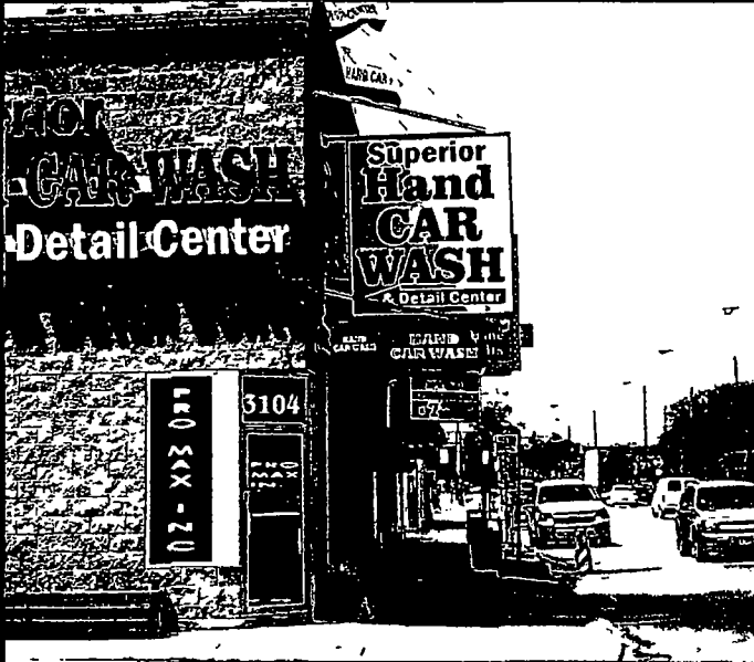
East Side of Building