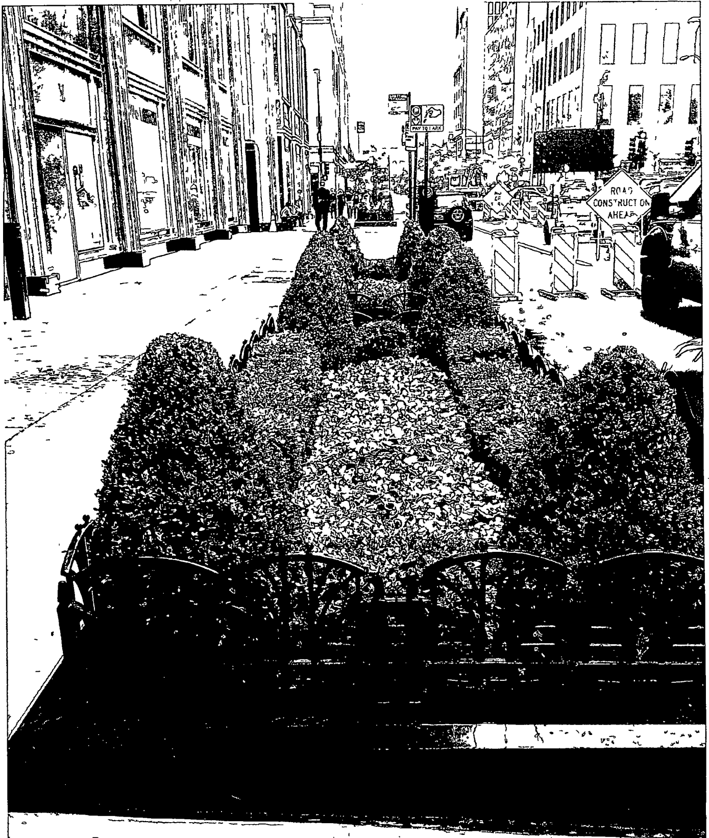
Walton St. Planters