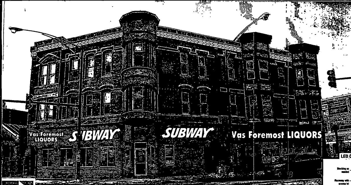
LED CHANNEL - RACEWAY MOUNT