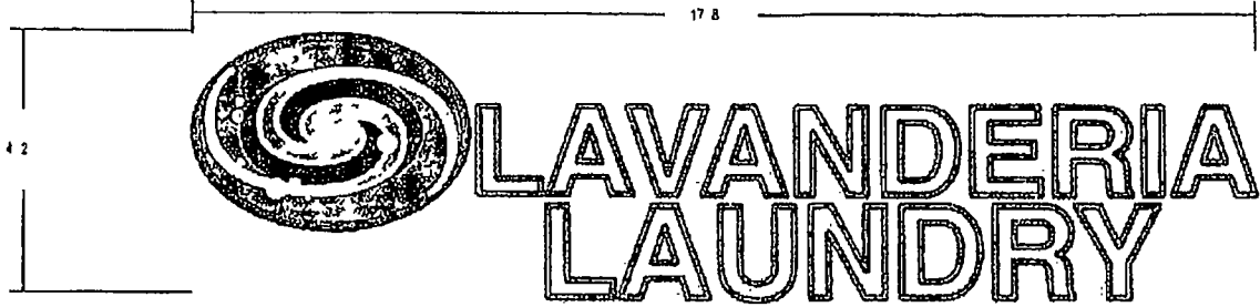
CHANNEL LETTER SIGN DETAIL SCALE 1/4" = 1'-0" (2)