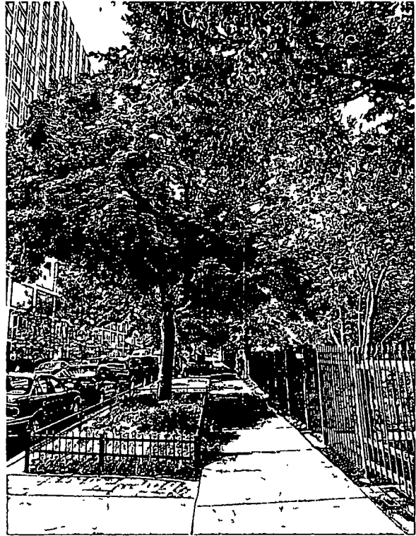
- 4315 N Hazel Street - Parkway (facing north)