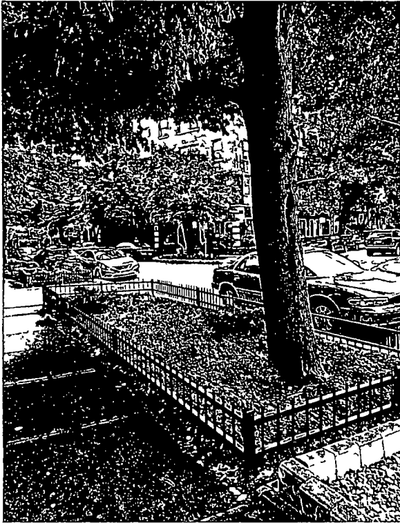
- 4315 N Hazel Street - Parkway (facing south)