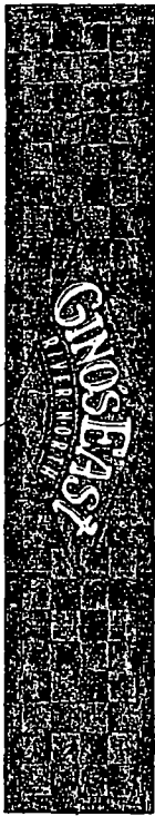
BACKGROUND OF DIAMOND CABINET IS OPAQUE