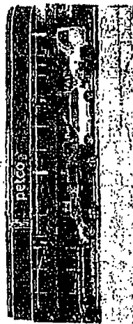
Front Elevation N. Division Ave. - Original Condition Not to Scale