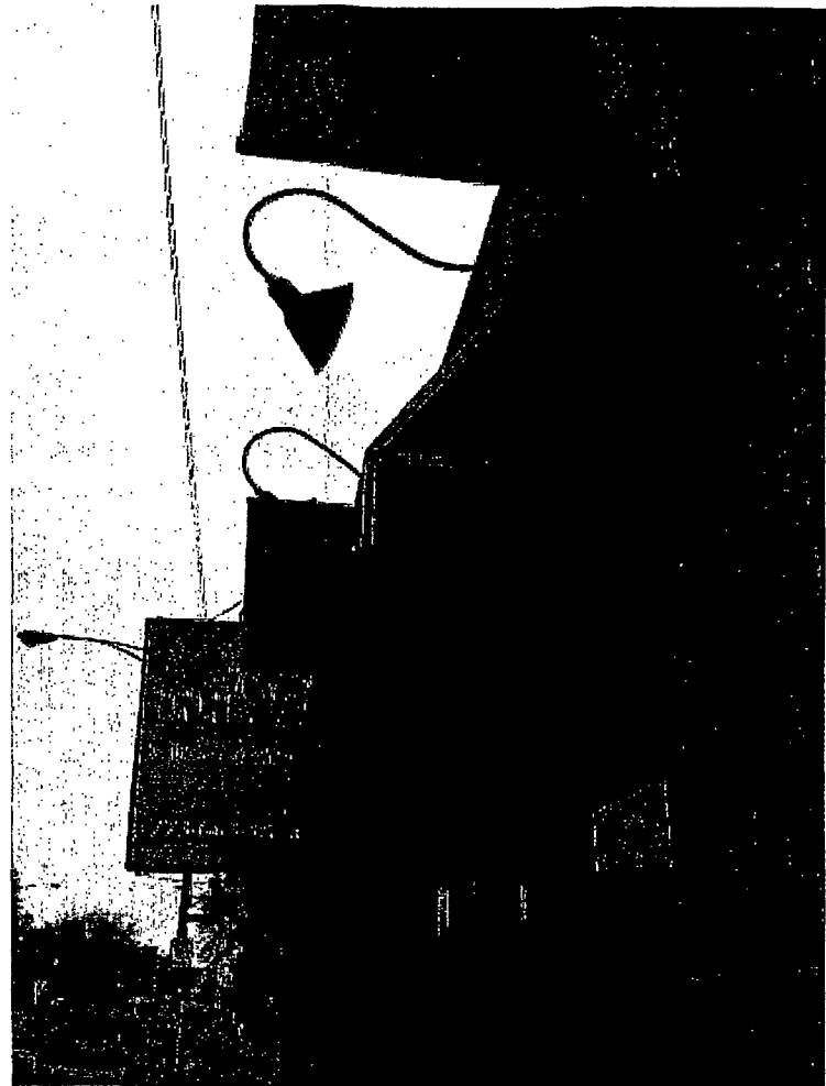
CITY SMILES 3800 N. PULASKI RD CHICAGO, IL 60641