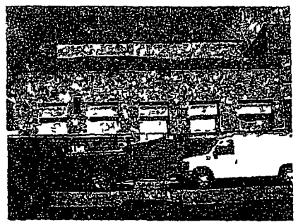
SIGN SHOWN ON NEW BUILDING