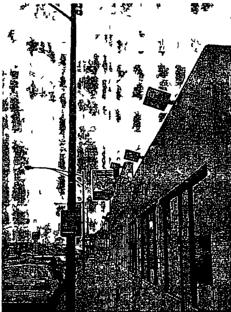
View of lights looking North from 48 th street down Pulaski