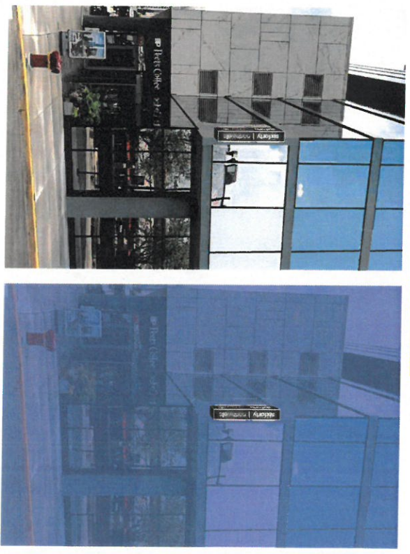
On the corner of Erie and Wells street Facing South-West