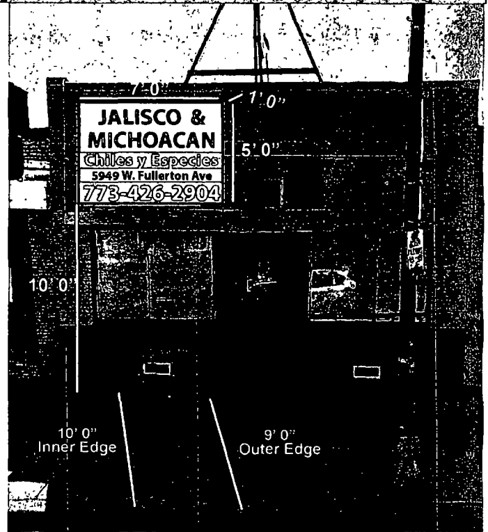
NOTE: Photo for representational purposes only. Signs are not to scale and may appear larger or smaller than shown.