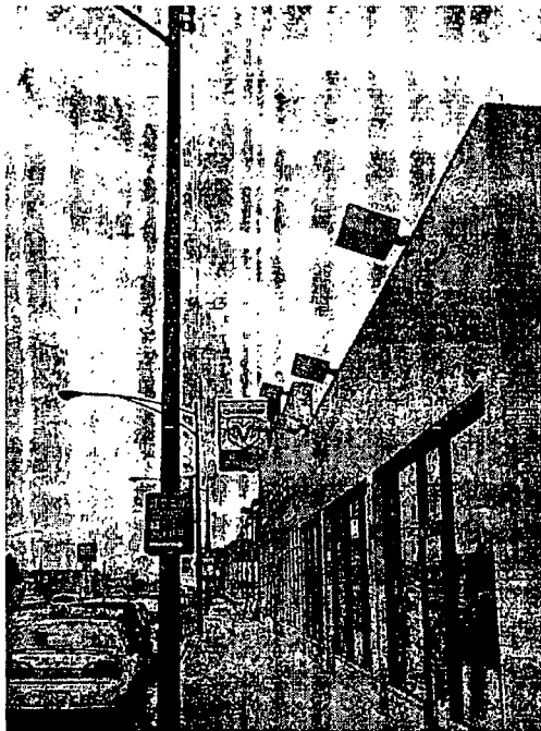
View of lights looking North from 48 th street down Pulaski