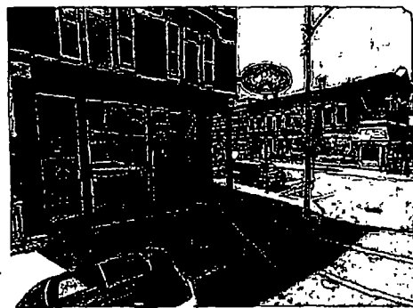
SIGN SHOWN MOUNTED ON CORNER OF BLDG.