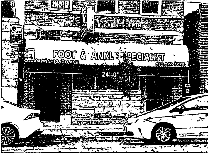
CANOPY SIGN AREA = 48 SQ FT