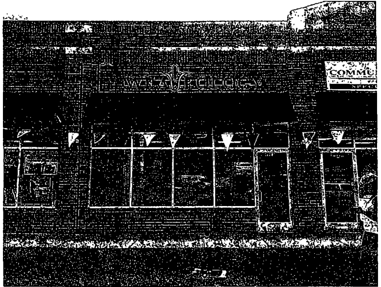
NOTE: Photo for representational purposes only. Signs are not to scale and may appear larger or smaller than shown.

This sign is intended to be installed in accordance with the requirements of Article 600 of the National Electrical Code and/or other applicable local codes.