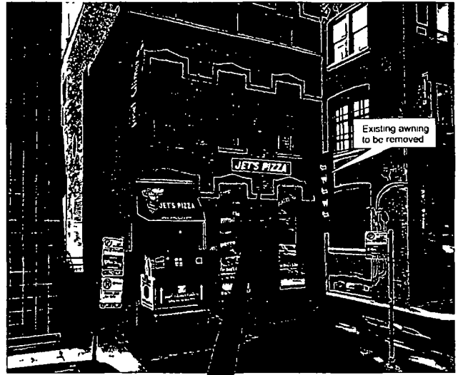
Illustrative View Before & After