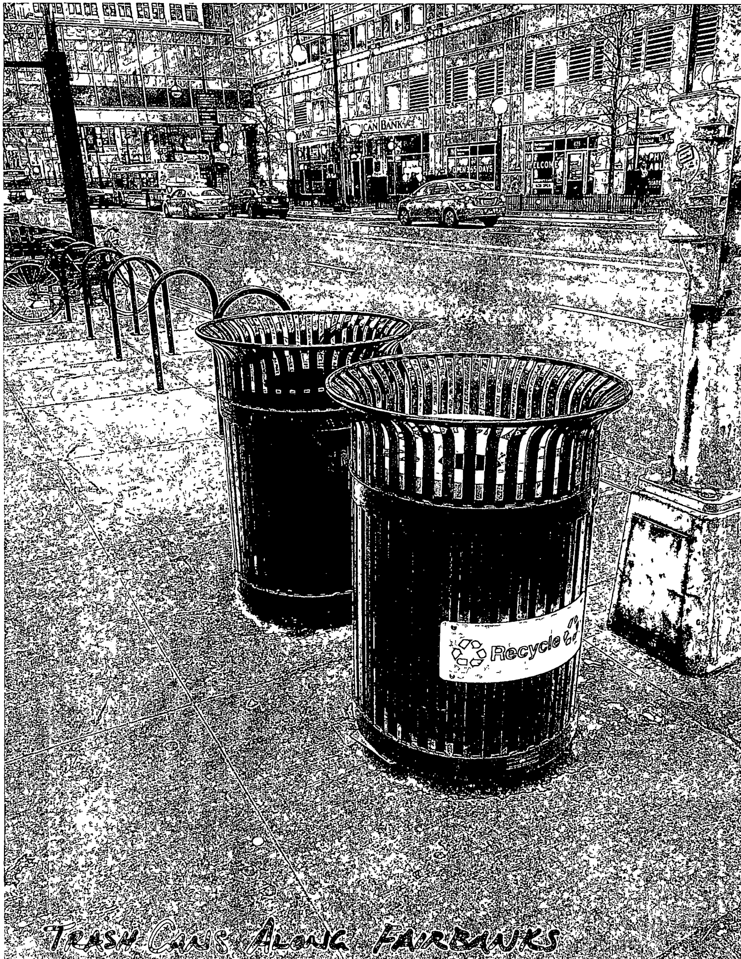
TRASH CANS ALONG FAIRBANKS