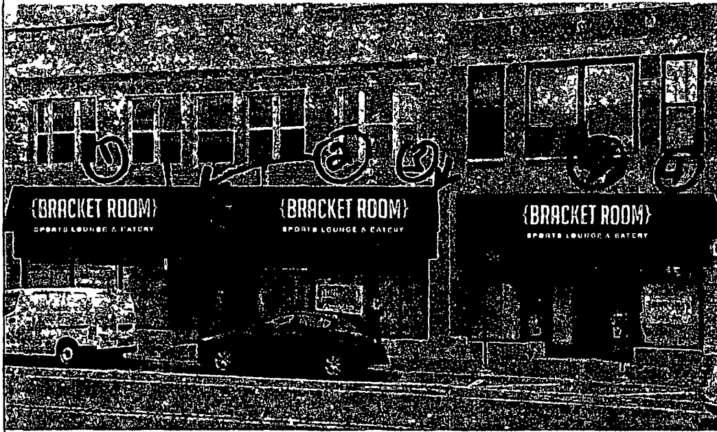
HALSTED STREET ELEVATION

4 Traditional Awnings with approximate dimensions Drop 4' includes 6 Rigid Valance Projection 2' Widths #1 18 5' - #2 9 1/2' - #3 18 4" - #4 21' - Bottom of Awnings will be 9' Above Grade #1 36 Sq ft Graphics #2 0 Sq ft Graphics #3 36 Sq ft Graphics #4 36 Sq ft Graphics