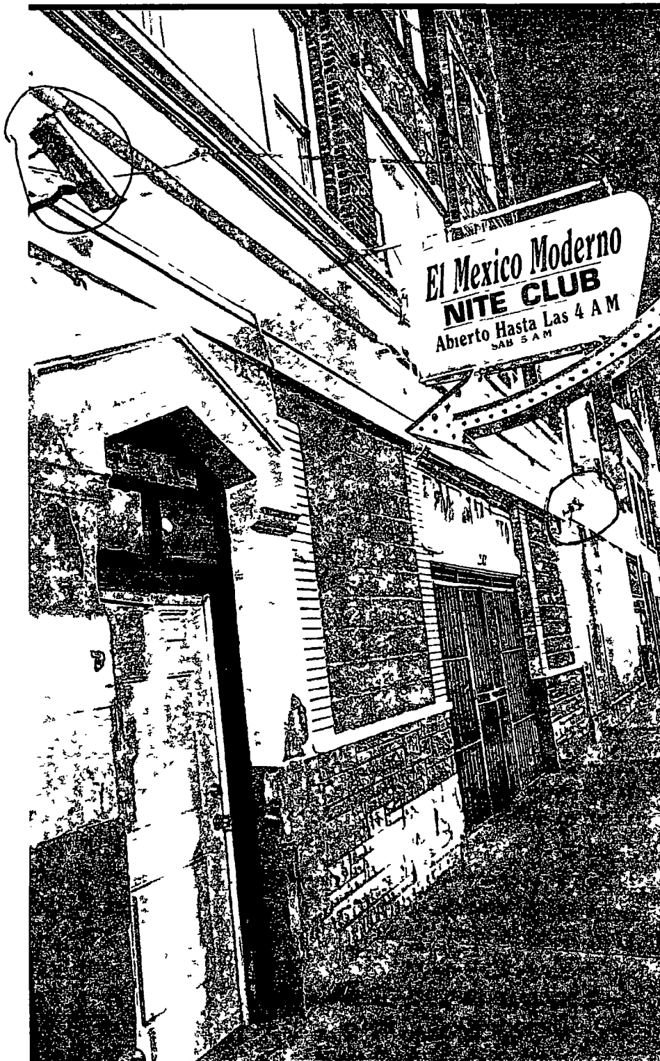
"Alsol, Inc" d/b/a El Mexico Moderno Camera Photo