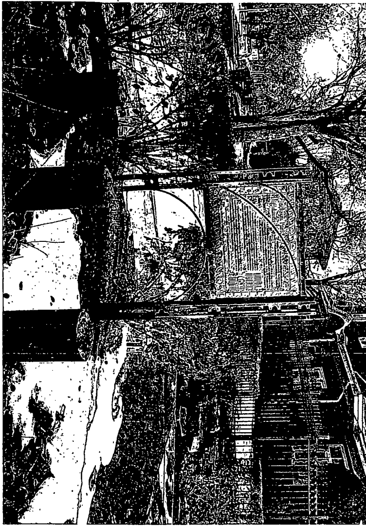
6900 S. Cregier