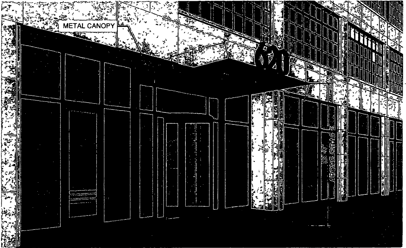
Property Location 620 North LaSalle Drive Organization's Name Next Gateway, LLC