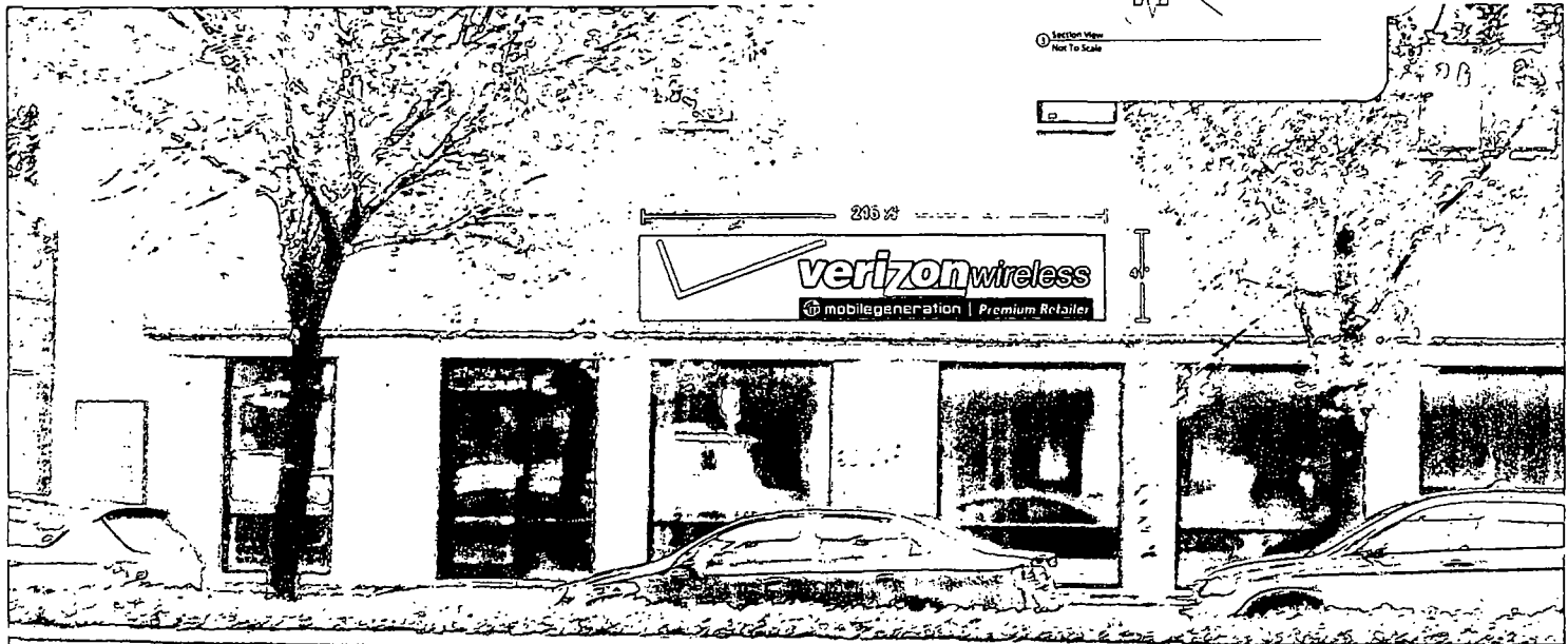
3/16" scale on fascia