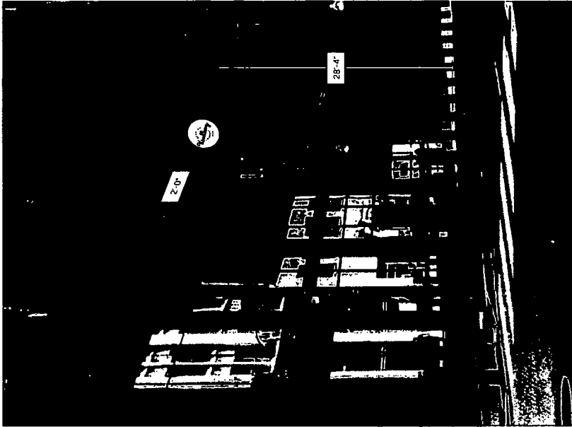
Proposed - NIS

[F] - MOUNTING Material Aluminum Color Black