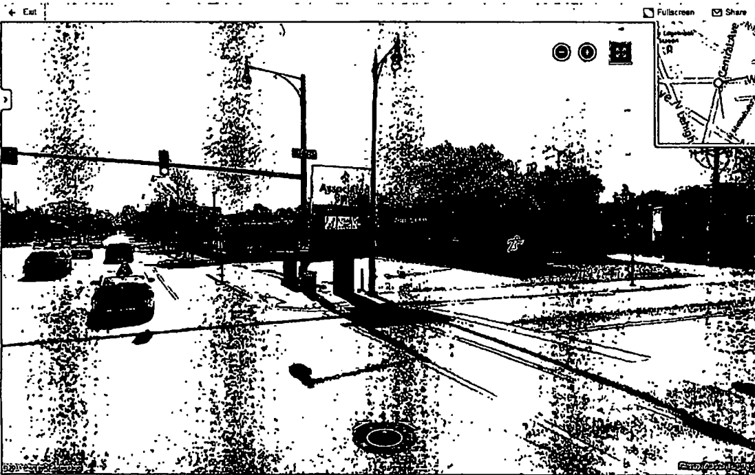
Looking East down Devon from Central