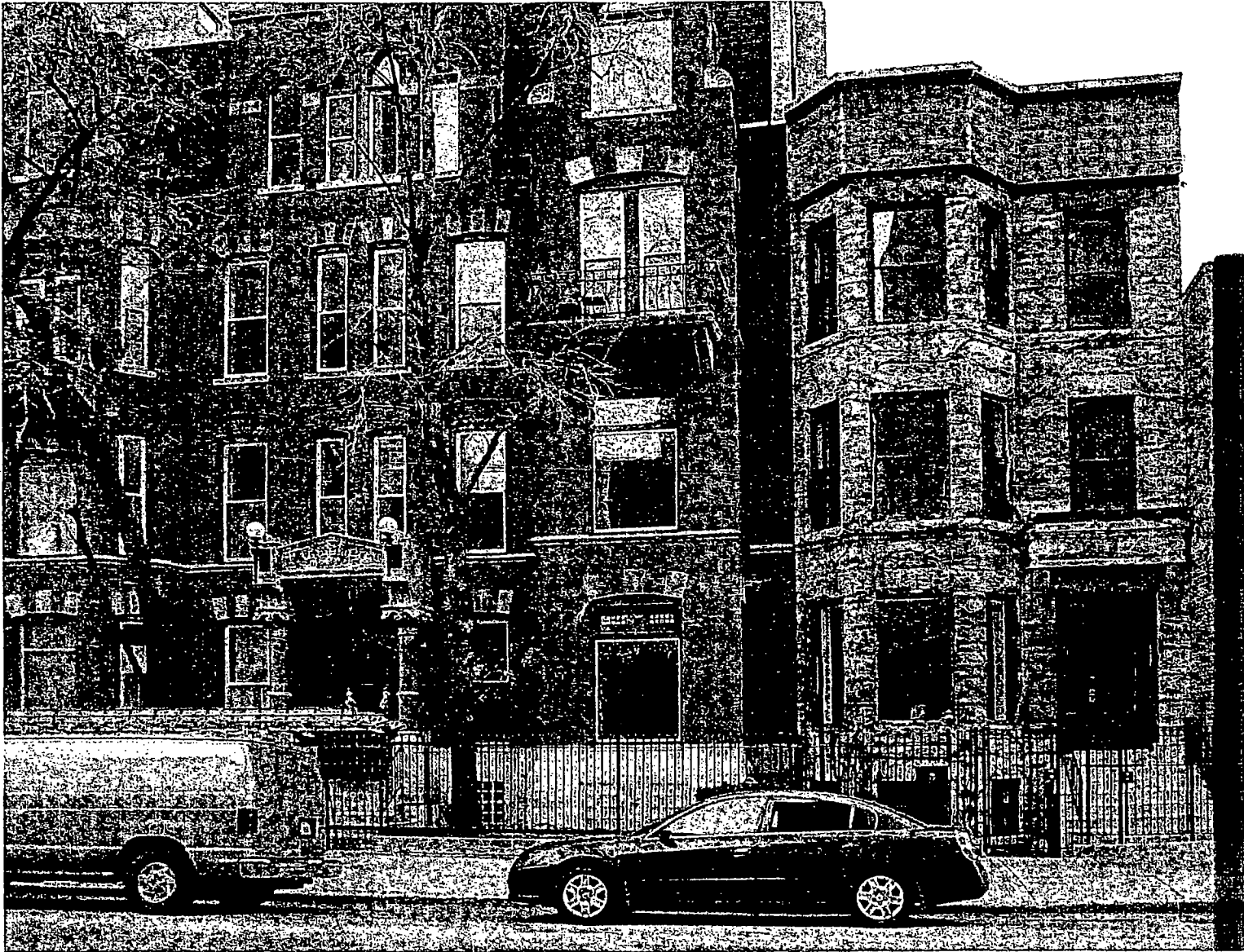
55 W. Erie